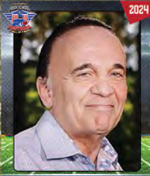
BOBBY DIGERONIMO CONTRIBUTOR