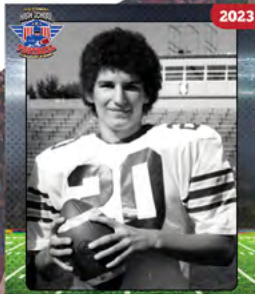
BERNIE KOSAR QB BOARDMAN HS c/o 1981