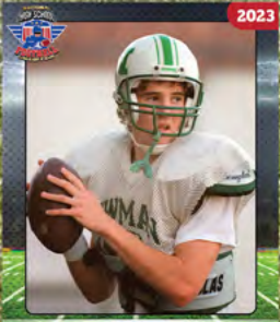
ELI MANNING QB ISIDORE NEWMAN HS c/o 1998