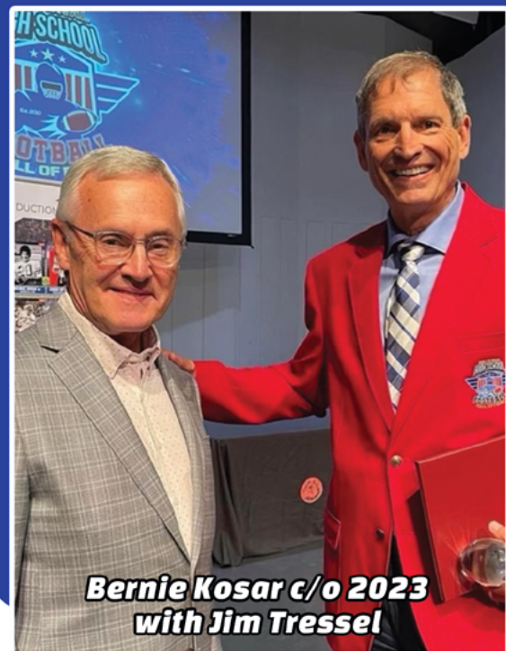
Bernie Kosar c/o 2023 with Jim Tressel