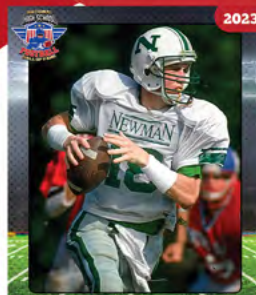
PEYTON MANNING QB ISIDORE NEWMAN HS c/o 1994